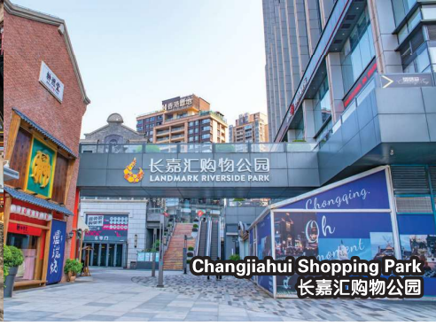
Changjiahui Shopping Park 长嘉汇购物公园