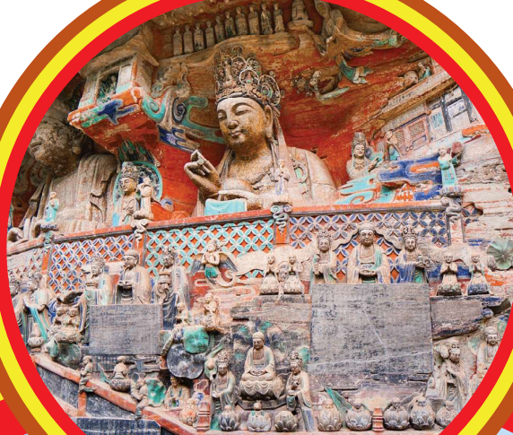
Dazu Rock Carvings Scenic Area 大足石刻宝顶山景区