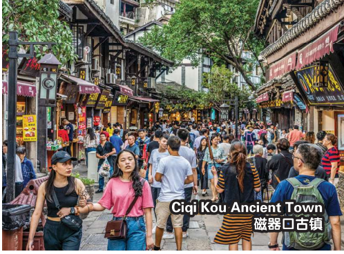
Ciqi Kou Ancient Town 磁器口古镇