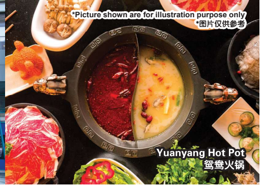
Yuanyang Hot Pot 鸳鸯火锅

*Picture shown are for illustration purpose only *图片仅供参考