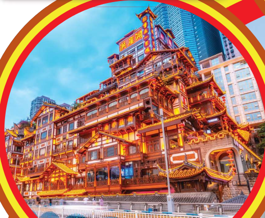
Hongya Cave Scenic Area 洪崖洞风景区