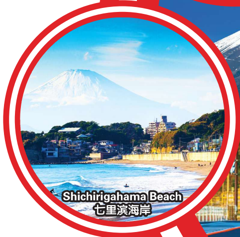
Shichirigahama Beach 七里滨海岸