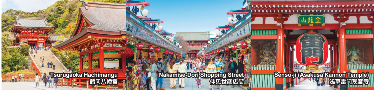
Tsurugaoka Hachimangu 鹤冈八幡宮