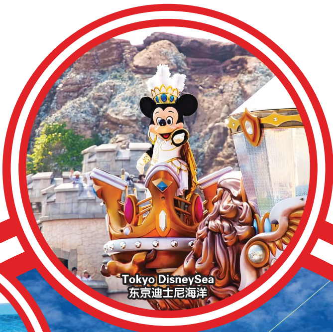
Tokyo DisneySea 东京迪士尼海洋