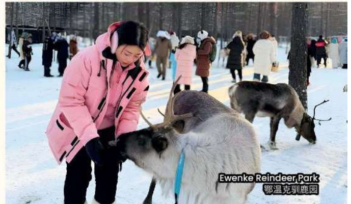
Ewenke Reindeer Park 鄂温克驯鹿园