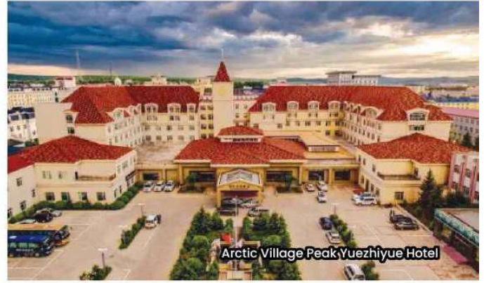
Arctic Village Peak Yuezhijue Hotel