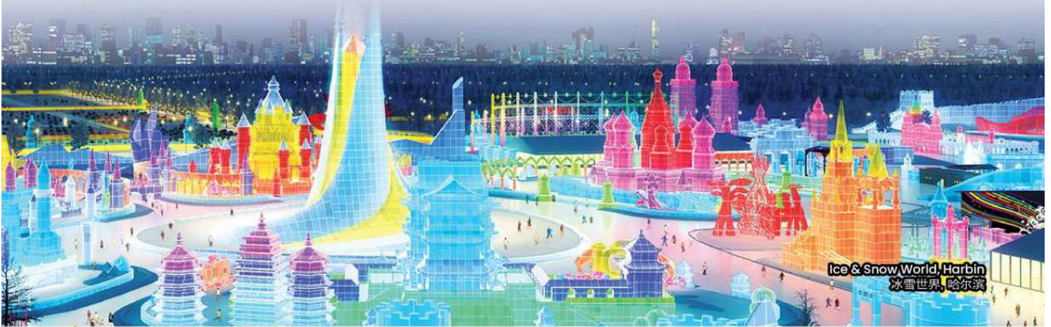
Ice & Snow World, Harbin 冰雪世界, 哈尔滨