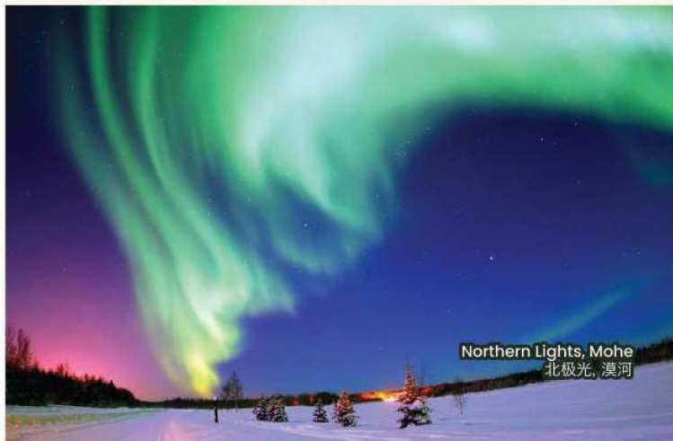
Northern Lights, Mohe 北极光, 漠河