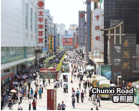
Chunxi Road 春熙路