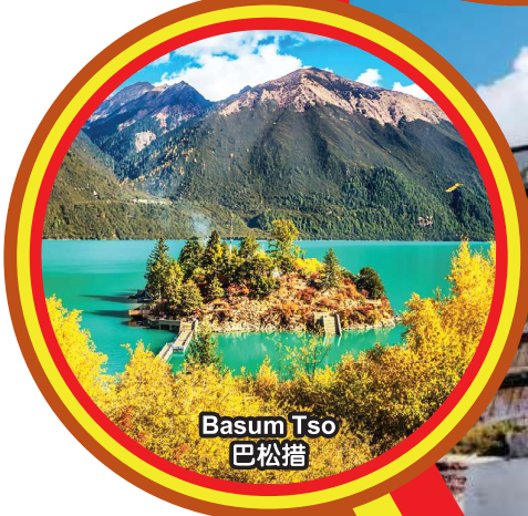
Basum Tso 巴松措