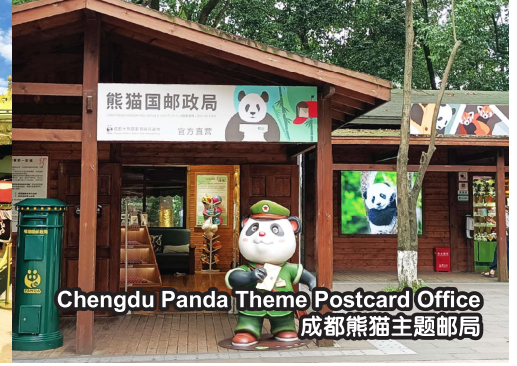
Chengdu Panda Theme Postcard Office 成都熊猫主题邮局