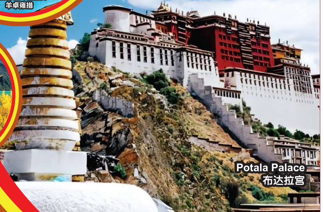
Potala Palace 布达拉宫