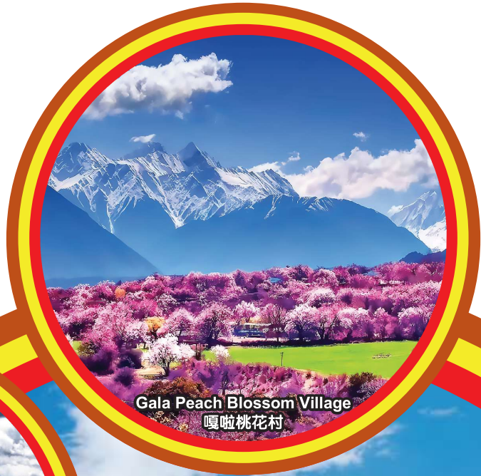
Gala Peach Blossom Village 嘎啦桃花村