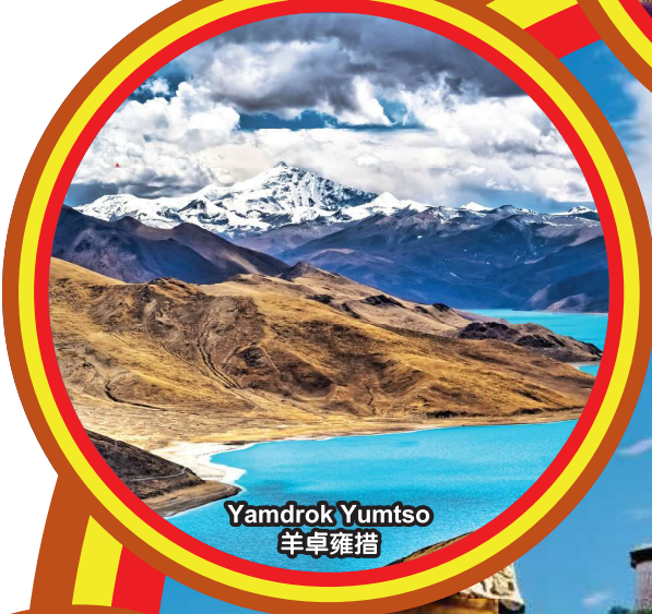
Yamdrok Yumtso 羊卓雍措