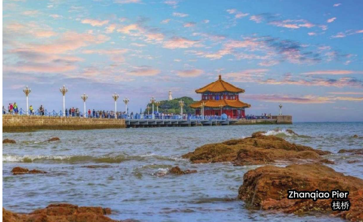
Zhanqiao Pier 栈桥