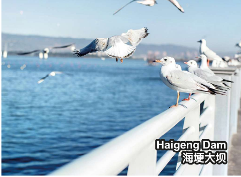
Haigeng Dam 海埂大坝