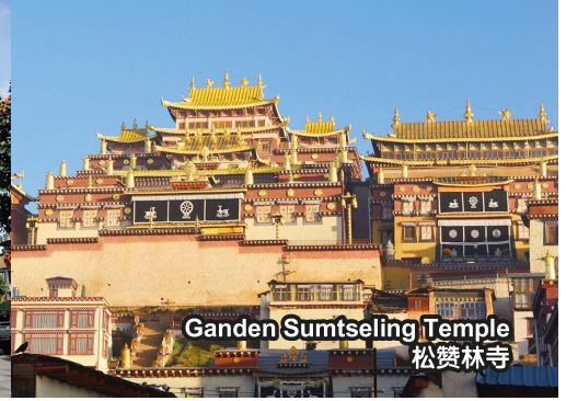
Ganden Sumtseling Temple 松赞林寺