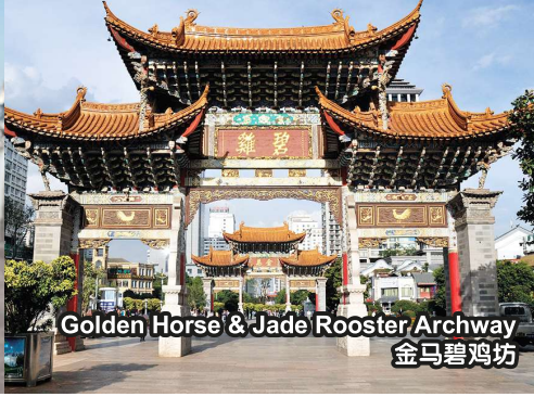
Golden Horse & Jade Rooster Archway 金马碧鸡坊