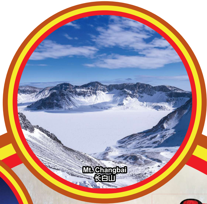
Mt. Changbai 长白山