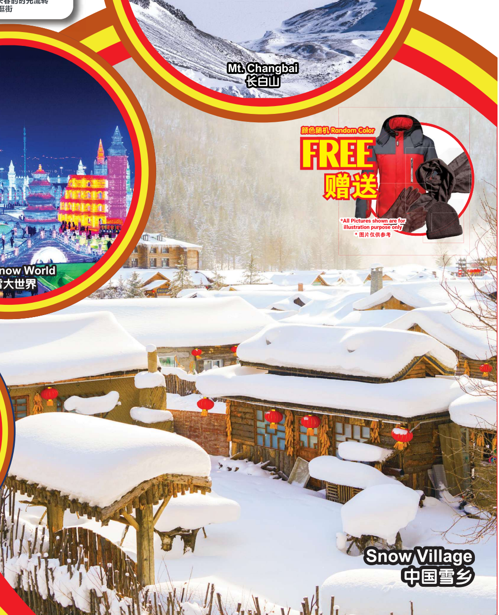
Snow Village 中国雪乡

行程次序, 以当地旅社安排为准。 Sequences of Itinerary are subject to local arrangement.