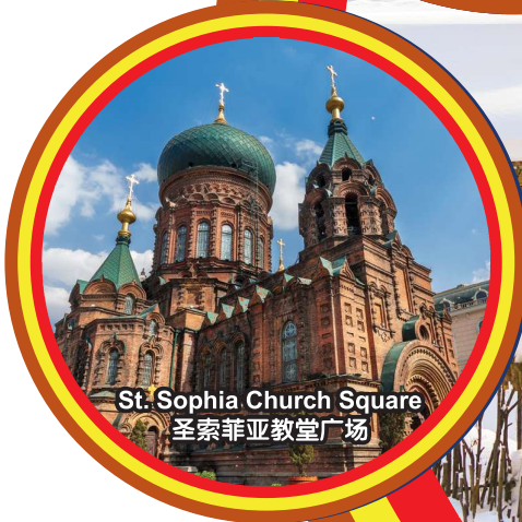
St. Sophia Church Square 圣索菲亚教堂广场

*All Pictures shown are for illustration purpose only • 图片仅供参考