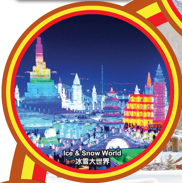
Ice & Snow World 冰雪大世界