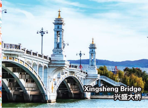
Xingsheng Bridge 兴盛大桥