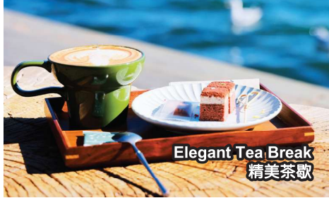
Elegant Tea Break 精美茶歇

*Picture shown are for illustration purpose only *图片仅供参考