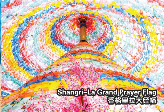
Shangri-La Grand Prayer Flag 香格里拉大经幡