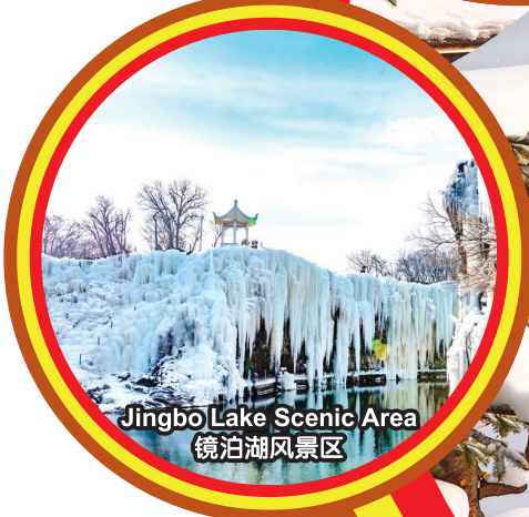
Jingbo Lake Scenic Area 镜泊湖风景区

*All Pictures shown are for illustration purpose only *图片仅供参考