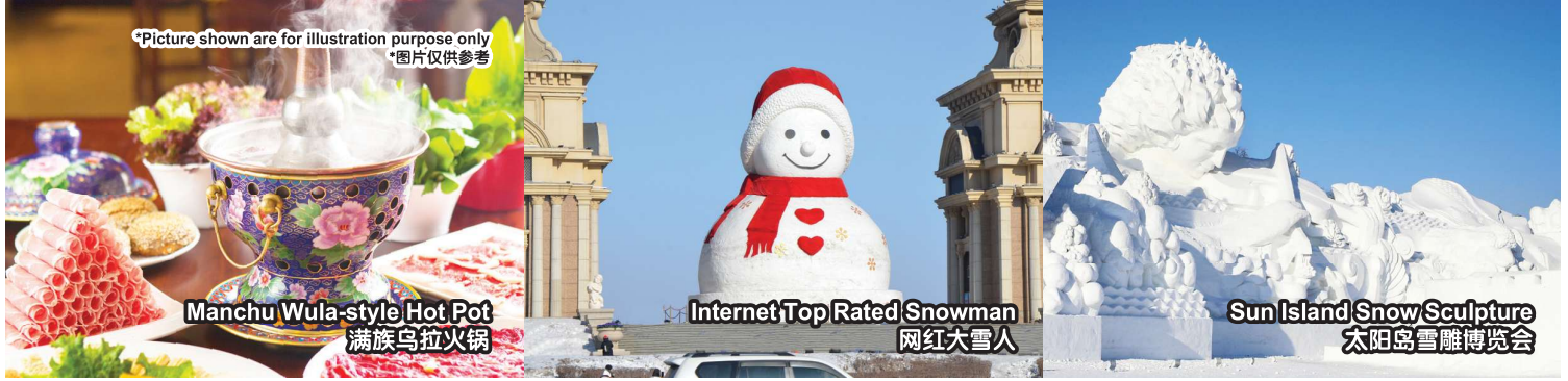
Manchu Wula-style Hot Pot 满族乌拉火锅

*Picture shown are for illustration purpose only *图片仅供参考