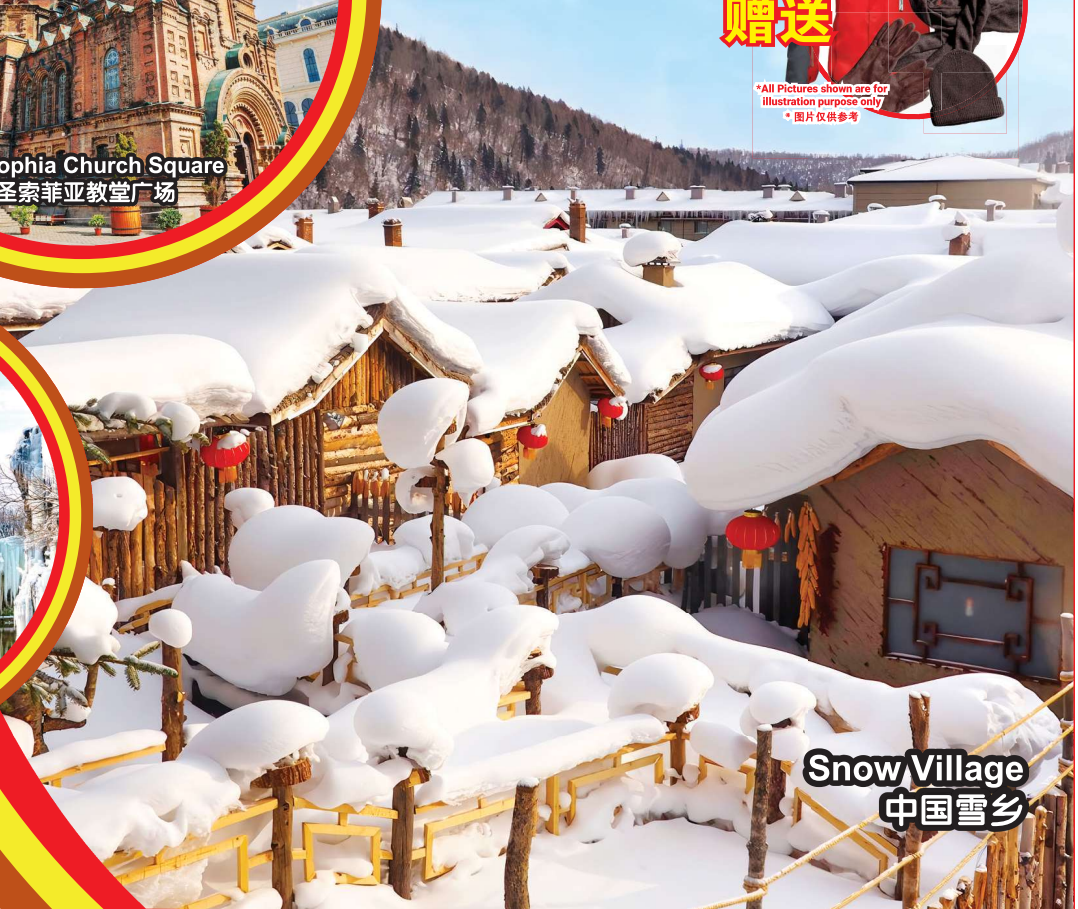
Snow Village 中国雪乡

行程次序·以当地旅社安排为准。 Sequences of Itinerary are subject to local arrangement.