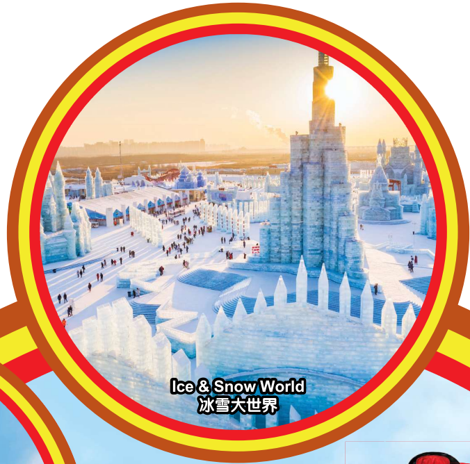
Ice & Snow World 冰雪大世界