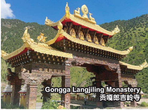
Gongga Langjiling Monastery 贡嘎郎吉岭寺