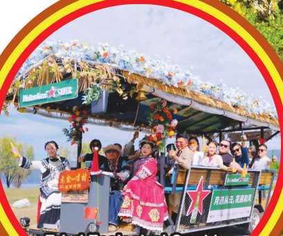
Erhai Ecological Corridor 洱海生态廊道