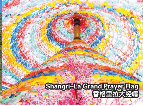
Shangri-La Grand Prayer Flag 香格里拉大经幡