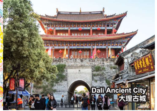
Dali Ancient City 大理古城