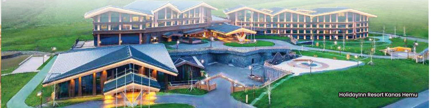
HolidayInn Resort Kanas Hemu

Embark on a complete journey at 4-star & 5-star hotel, offering a quality & comfortable stay. 全程安排四+五星级酒店, 让您在整个旅程中享受到有质量且舒适的住宿环境。