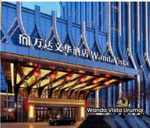
Wanda Vista Urumqi