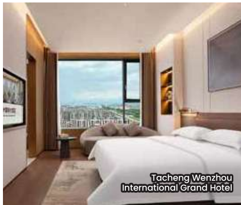
Tacheng Wenzhou International Grand Hotel