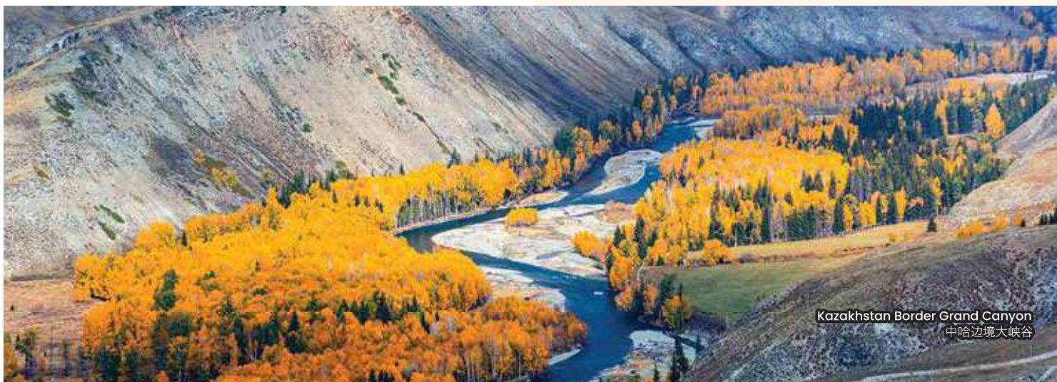
Kazakhstan Border Grand Canyon 中哈边境大峡谷

行程次序以当地旅行社安排为准。行程，膳食，住宿，交通等可能会因不可抗力因素而更动，恕不另行通知。