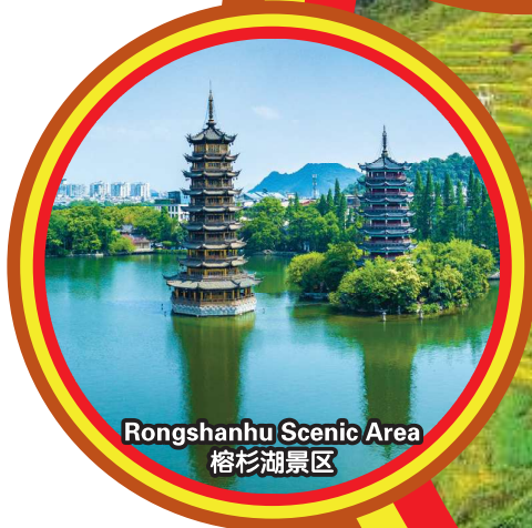
Rongshanhu Scenic Area 榕杉湖景区