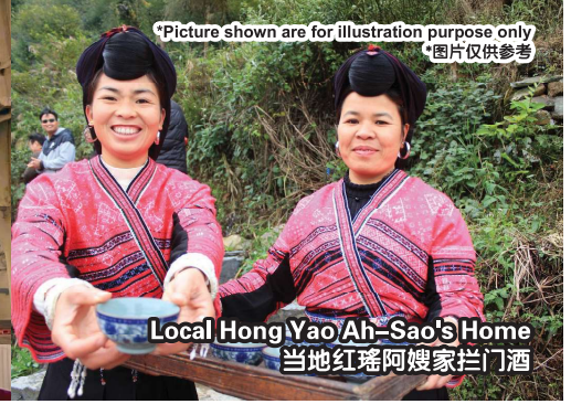
Local Hong Yao Ah-Sao's Home 当地红瑶阿嫂家拦门酒

*Picture shown are for illustration purpose only *图片仅供参考