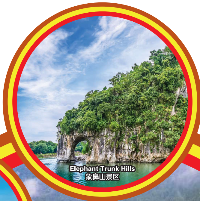
Elephant Trunk Hills 象鼻山景区