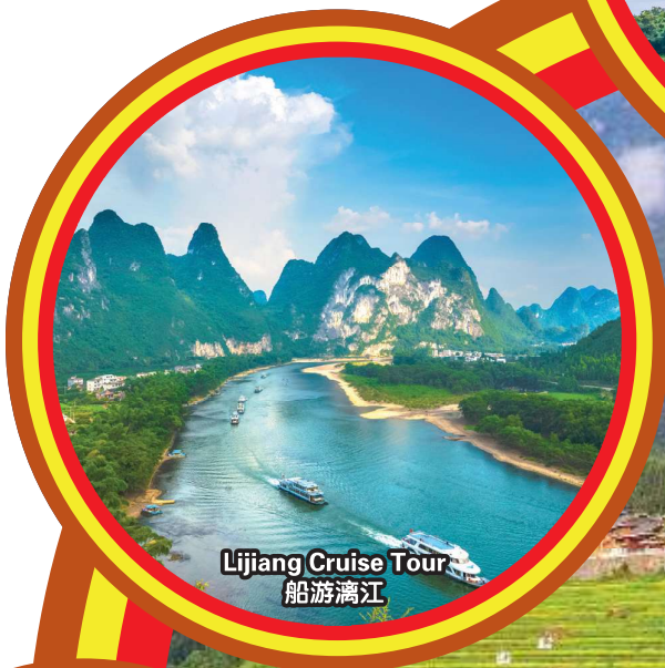
Lijiang Cruise Tour 船游漓江