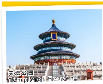
天坛公园 Temple of Heaven