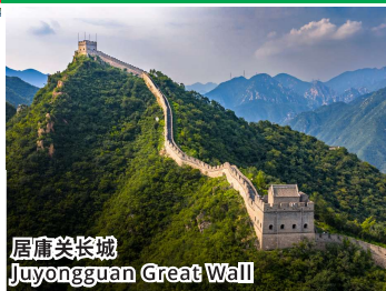
居庸关长城 Juyongguan Great Wall