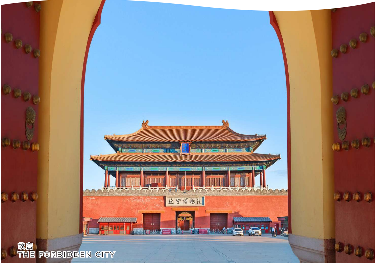
故宫 THE FORBIDDEN CITY