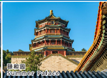
颐和园 Summer Palace