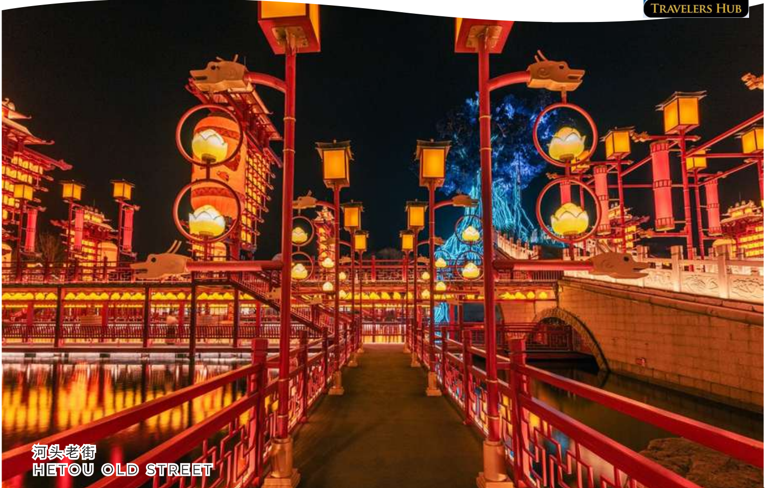
河头老街 HETOU OLD STREET