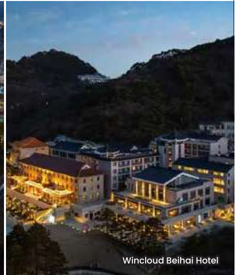
Wincloud Beihai Hotel