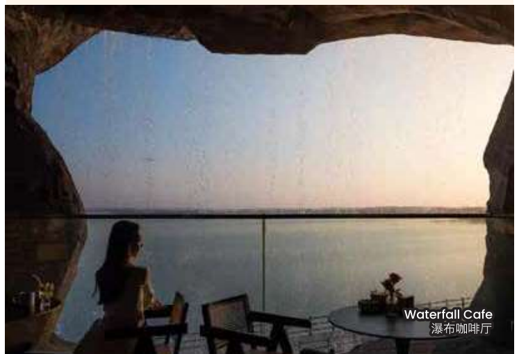
Waterfall Cafe 瀑布咖啡厅

Sequences of itinerary are subject to local arrangement. Itineraries, meals, hotels and transportation are subject to change without prior notice.