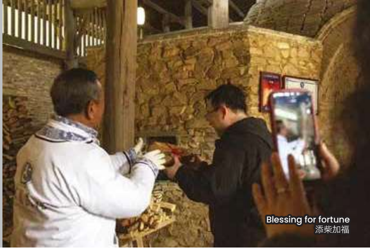
Blessing for fortune 添柴加福