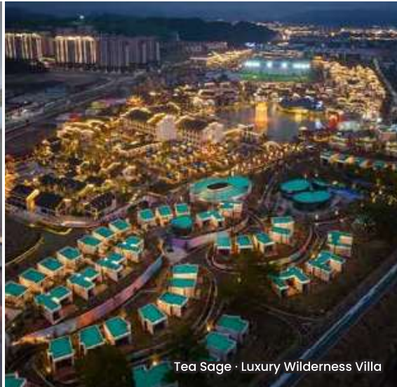
Tea Sage - Luxury Wilderness Villa