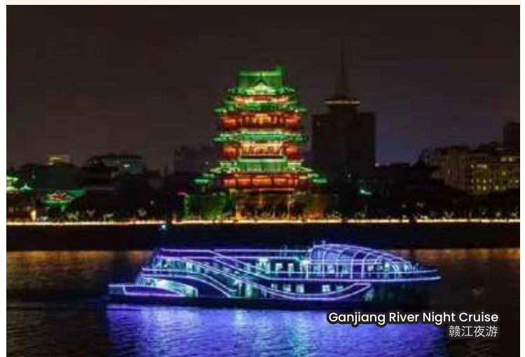
Ganjiang River Night Cruise 赣江夜游