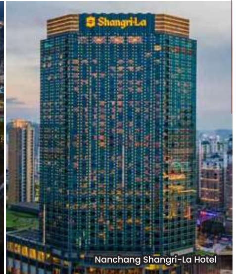
Nanchang Shangri-La Hotel