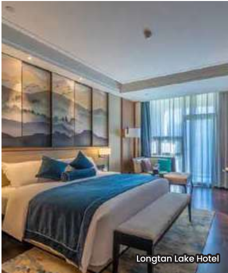
Longtan Lake Hotel